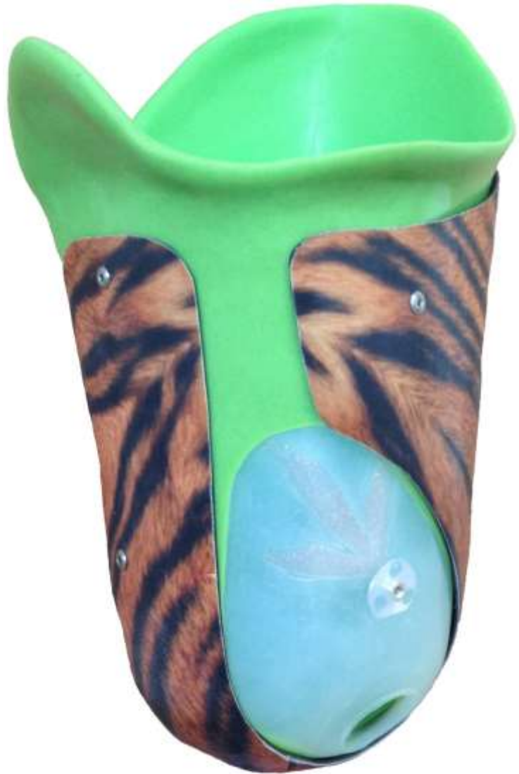
Illustration: The Icke- affixes the silicone liner to the carbon frame.